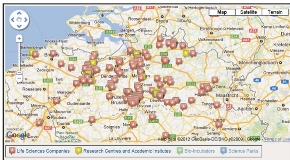
Figure 2. Map of life sciences firms and PROs in Flanders

(2011), an expert on public–private partnerships in Flanders, IWT never funds entire projects but only funds certain percentages thereof—depending on the project’s research focus, the size of the companies involved and the involvement of international R&D partners. Importantly, though, the applicants are aware that only partial funding will be granted, which—according to De Cleyn—leads firms to over-apply for funds by indicating higher amounts than actually needed. This implies that R&D collaborations are de facto subsidized entirely.